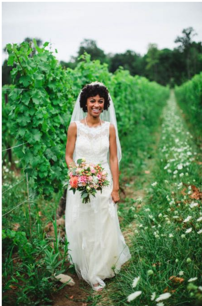
Buttonwood Grove Winery/Photo courtesy of Izzy Hudgins

The Long Island North Fork AVA vista has the look of the Hamptons without the price tag. Convenient for a New York City arrival, many Long Island wineries offer wedding venues accommodating up to 250 guests. Notable wedding locations with highly rated wine portfolios are: Macari Vineyards, Mattituck & Cutchogue, NY; Wölffer Estate Vineyards, Sagaponack, NY; and Bedell Cellars, Cutchogue, NY.